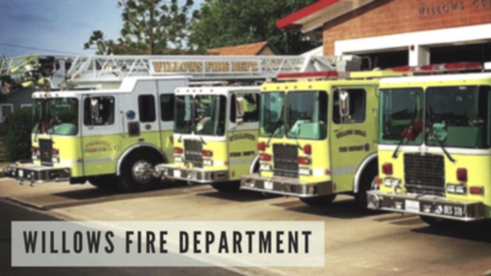
WILLOWS FIRE DEPARTMENT